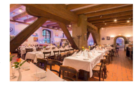
TABLE TOP EXHIBITION